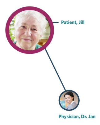
Figure 1. Individual models of care dominate current approaches

Together, these groups constitute an individual's social convoy, that is, the people we count on and the people we draw into our networks during times of need. There is enormous value and wealth inherent in our social convoys. These networks of individuals keep us safe, secure, and healthy by contributing instrumental, informational, and emotional support. The value of our networks is evident through multiple studies demonstrating that people heal more quickly, get sick less often, and use health and human services more efficiently when they have a supportive network (e.g., Umberson and Montez, 2010: tinyurl.com/85fxc5k; Ellaway et al., 1999: tinyurl.com/7x5gp2a). Thus, our networks are key social determinants of our health and ample research reinforces the truth of the proverb "a good friend is the medicine of life".