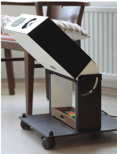
Figure 1. The Qwiek.up media system (right) depicting a walk through a forest on a regular wall (left)

care homes, where it can be used as a meaningful activity or as a non-pharmaceutical remedy for stress and agitation, which potentially reduces medicine use in care environments.